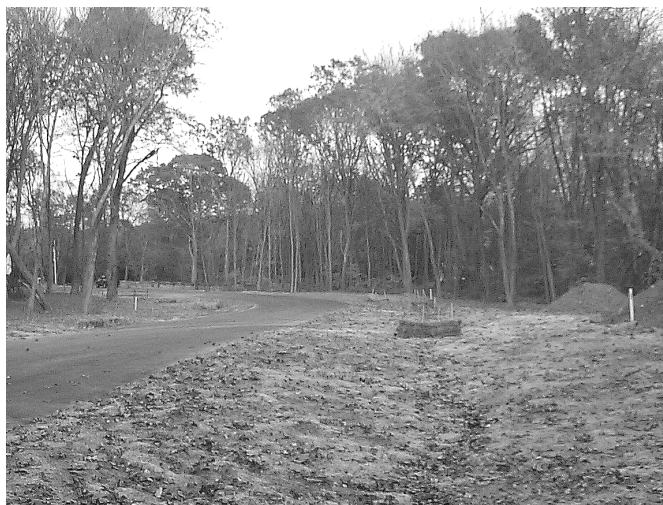
Figure 3. Old Saybrook model stormwater subdivision, showing grassed swale drainage system.

In addition, the Old Saybrook Planning & Zoning Commission, in collaboration with the NEMO Task Force, Town Engineer and a local developer, have implemented a "model subdivision" in town (Figures 3 and 4). The subdivision incorporates vegetated swales, narrow road widths and clustering to help manage stormwater runoff and reduce nonpoint source pollution. Planning and Zoning is also updating its regulations to incorporate impervious surface limits in their business districts, in order to minimize impacts from development to their coastal resources and Long Island Sound. Finally, the Commission will be considering incorporating nonpoint source management strategies in the update of its POCD.