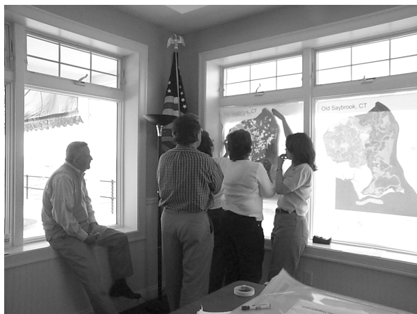
Figure 2. Members of the Old Saybrook NEMO task force review maps from the town natural resource inventory.

The town NEMO task force had their first meeting with NEMO staff in January of 2001. Town officials were initiating an update to their POCD and were concerned about both topical issues (e.g., water resource protection) and process issues (e.g., lack of communication between boards and commissions). The town Conservation Commission has conducted a natural resource inventory, and is working with the NEMO team on an open space plan that incorporates the inventory information (Figure 2). The Conservation Commission is working with the Planning and Zoning Commission to then insert the open space plan into the updated POCD.