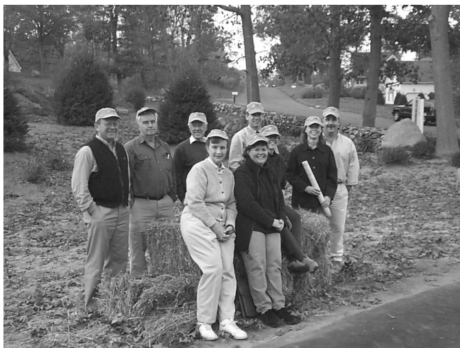
Figure 4. Old Saybrook NEMO task force poses at model subdivision site with the site developer, the town's First Selectman, and the NEMO CT Programs Coordinator.